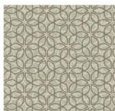
40454-4 Light Grey